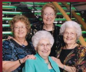
THE RICE SISTERS Speakers